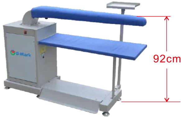
GM-1150 (NO HEATER) 抽濕開褲縫臺 GM-1150H (WITH HEATER) 電加熱抽濕開褲縫臺 TROUSERS SEAM OPENING TABLE