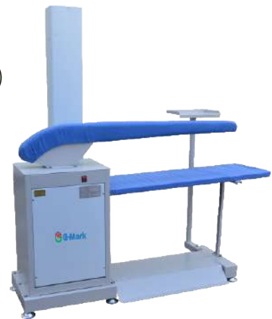
GM-1170S-II ( NO HEATER) 上排風抽濕開褲縫臺 GM-1170SH-II ( WITH HEATER) 電加熱上排風抽濕開褲縫臺 TROUSERS SEAM OPENING TABLE WITH UPWARD EXHAUST PIPE

可加裝上排風(S) (需另行訂購) Adding upward exhaust pipe (S) (Optional)