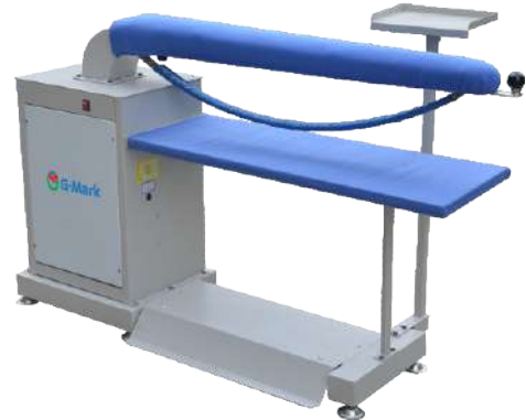
GM-1150F (NO HEATER) 抽濕開褲縫臺 GM-1150FH (WITH HEATER) 電加熱抽濕開褲縫臺 TROUSERS SEAM OPENING TABLE (帶張緊鏈型) WITH FLEXIBLE CHAIN TYPE