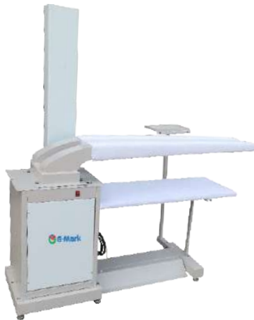
GM-1180S-I (NO HEATER) 上排風雙臂抽濕開褲縫臺 GM-1180SH-I ( WITH HEATER) 電熱上排風雙臂抽濕開褲縫臺 TROUSERS SEAM OPENING TABLE WITH UPWARD EXHAUST PIPE WITH 2 BUCKS

可加裝上排風(S) (需另行訂購) Adding upward exhaust pipe (S) (Optional)