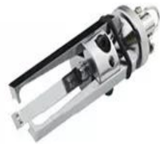
Three claw clamp