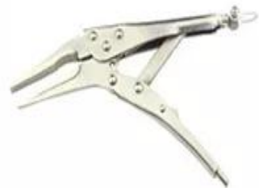
Clamp for big knife tongs