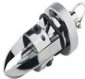
Three jaw clamp