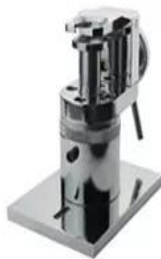
Button base fixture